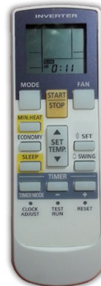
AC/Heat Remote (if applicable)

Garbage is to be disposed of only on Mondays and Thursdays, AFTER 5 PM. Trash must be placed sealed bags on the curbside. Failure to comply with City of Boston trash ordinance will result in fines up to $250 per offense.